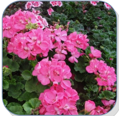
Rocky Mountain Lavender