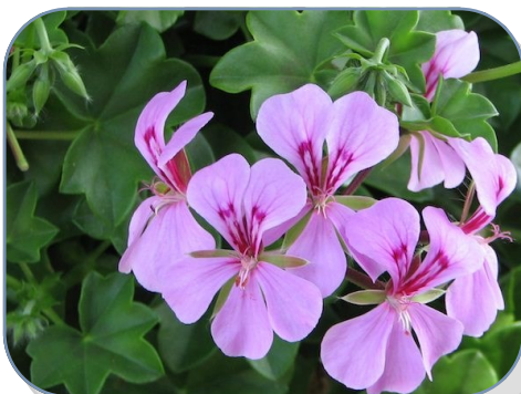
Blue Blizzard (Lavender)