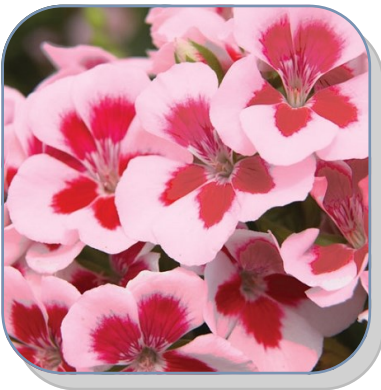
American Rose Mega Splash