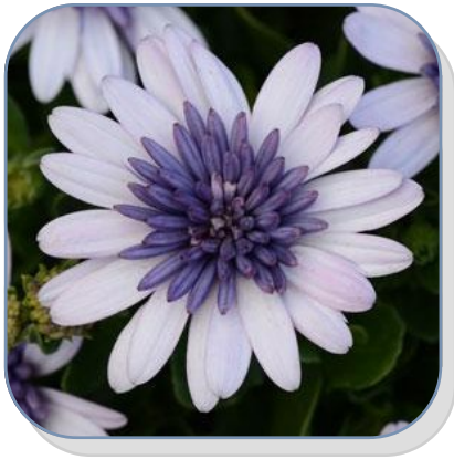
4D Violet Ice