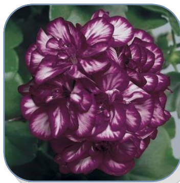
Contessa Burgundy Bi-Color