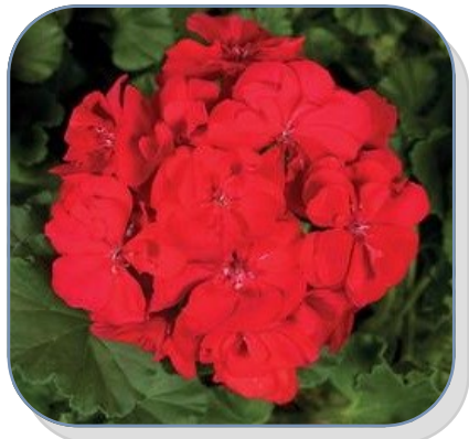
Tango Dark Red